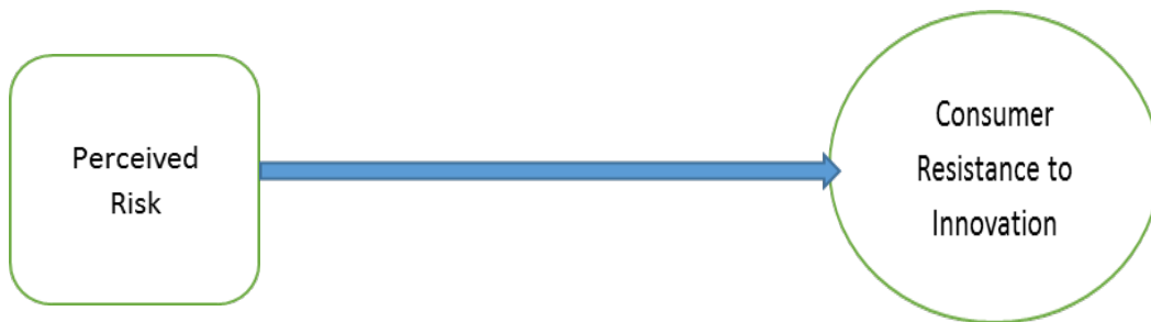
Figure 1 Proposed Framework

Pervious mainstream literature shows and verify the relationship and effect of perceived risk on intention related to consumer behavior in various fields such as electronic commerce e.g. Crespo et al.,(2009); Kim et al., (2008); Park & Jun, (2003); Belkhamza and Syed Azizi, (2009), e-filling system (Anna and Bee,2010), purchasing tickets on-line (Kim et al., 2005), purchasing via mail order Simpson and Lakner, (1993), and Internet banking Aldas-Manzano et al., (2009); Ozdemir and Trott, (2009). On the other side of the perceived risk associated with the financial, performance, and security risks were found to be significant in the case of smart phones. Following the mainstream literature on the perceived risk and consumer behavior towards innovation Yiu Chi et al., (2007), Dunphy and Herbig, (1995), Aggarwal et al., (1998) found a positive relationship in the context of a smart phone. From above literature there is contradiction between the relationship among perceived risk and innovation so this call for further research related to innovation especially in Smart phones.